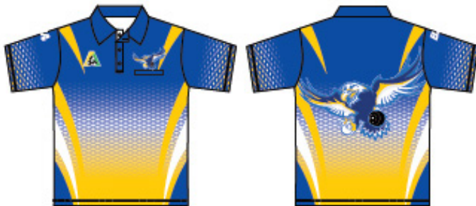
Standard Bowls Polo SS Mens