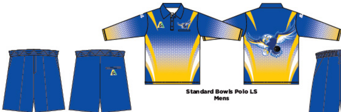
Standard Bowls Polo LS Mens