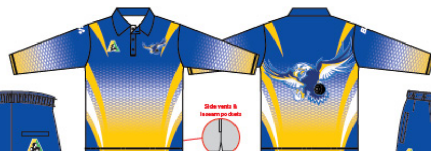
Standard Bowls Polo LS Ladies