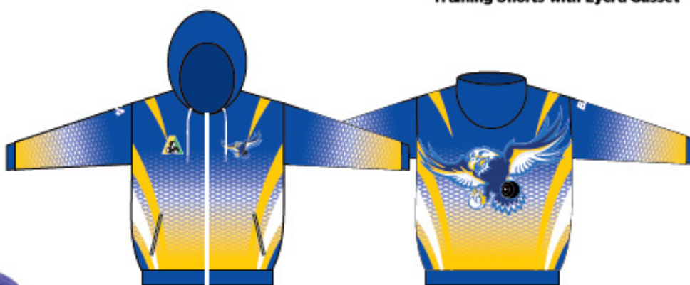
Full-Zip Sub Sweater Hoodie