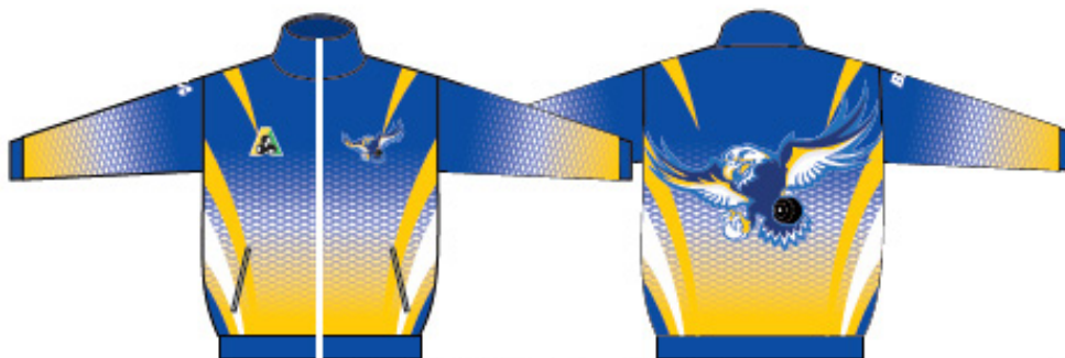
Full-Zip Sub Jacket Lined Tracksuit with Bungee Waist