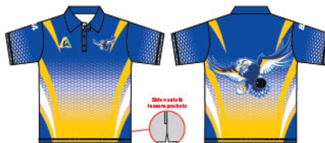
Standard Bowls Polo SS Ladies