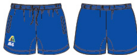
Training Shorts with Lycra Gusset