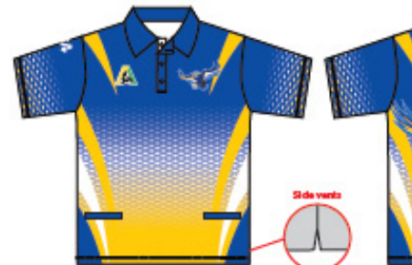
Standard Bowls Polo SS (Front Ladies